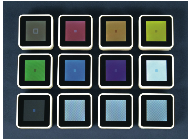
Figure 1. Colorigins runs on a set of 12 Sifteo Cubes. A video demonstration is available at https://vimeo.com/97997307 .