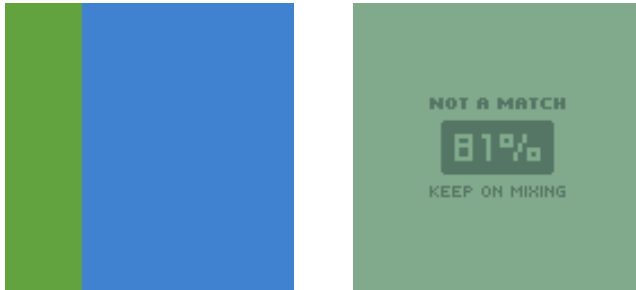
Figure 2c. (left) A progress bar shown during color mixing, visually displaying the current proportion of mixture. Figure 2d. (right) The match accuracy score display.