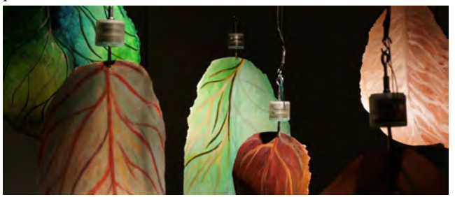
Figure 6: Detail of The Order of the Passions sound projectors

In producing the project, we have developed innovative new tools and methods. The interview process used to collect emotional video recordings was highly experimental and resulted in valuable techniques for eliciting non-posed emotional expressions. The automatic facial expression recognition system combines known methods in a novel way to create a productive human-computer system for identifying artistically viable facial images. The Media Diffusion System builds on past work to introduce a new way of composing with audio-visual data using complex image mark-up to create an integrated moving mediascape. We look forward to the further development of these tools and the project as a whole as we continue to build and expand this work.