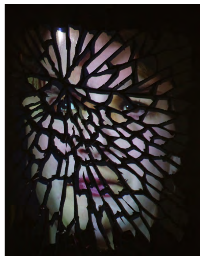
Figure 2: The Order of the Passions Installation view

Visually, the diversity is reflected within differences in facial appearances. In the aural sphere, the linguistic richness of diverse cultures and their dialogic interactions is expressed through the representation of a Canadian multilingual environment. The resultant whole reflects a multiplicity of different voices singing simultaneously, not only in dialogue, but also with an ear to each voice's uniqueness and interdependence (Bringhurst 2009).