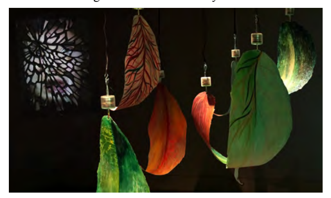
Figure 5: The Order of the Passions Installation: view of audio projectors (leaf shaped speakers) in relationship to screens.

Canadian cultural dialogues are expressed with these diverse voices, projected across eight audio channels, to signify a forest of linguistically complex environments that together build an image of diversity. Different voices, in different languages recite words about multiplicity of reflections seen in a broken mirror as a metaphor for a holistic understanding of diverse community.