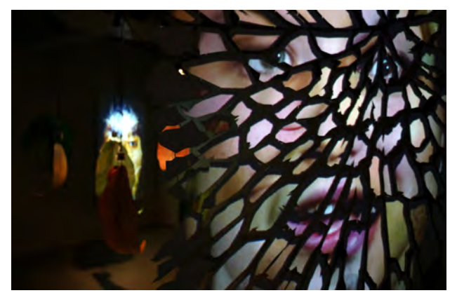
Figure 1: Detail of The Order of the Passions Installation

river of rich and diverse world cultures. This work reflects the multiplicity that we live in today.